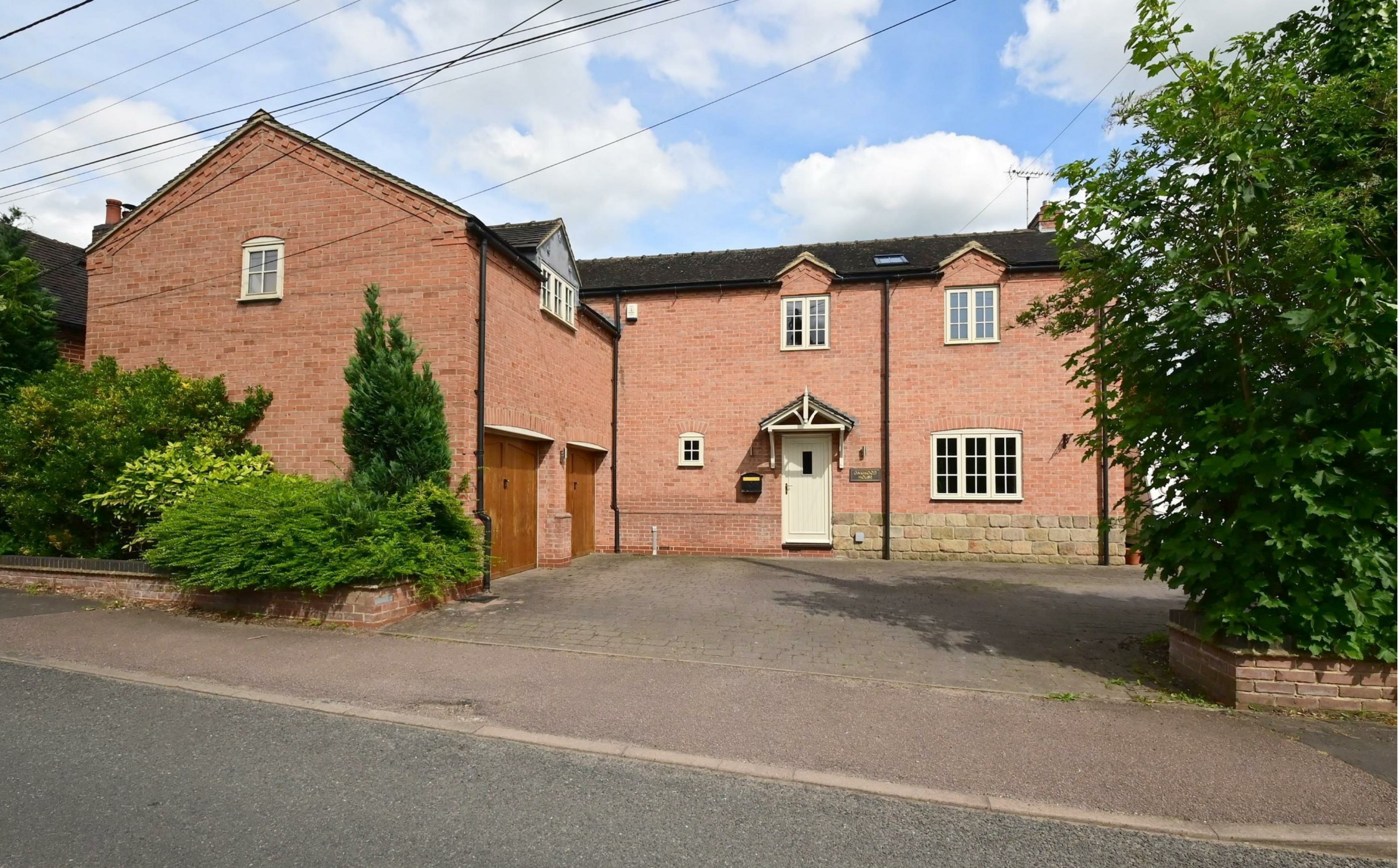
Oakwood House Wood Lane, Yoxall, Staffordshire, DE13 8PH