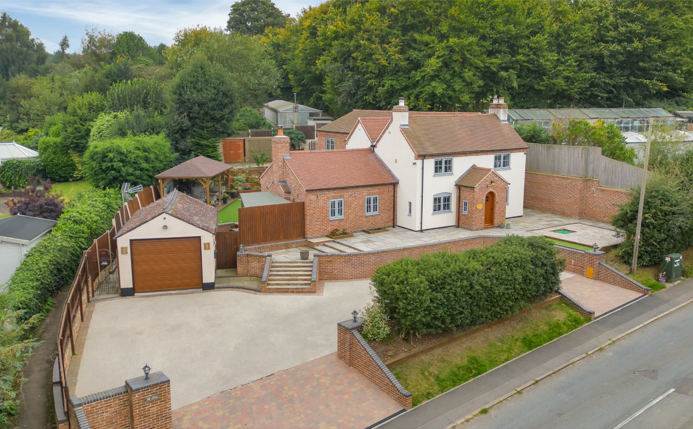
Holly Cottage, 82 Main Street, Clifton Campville, B79 0AP