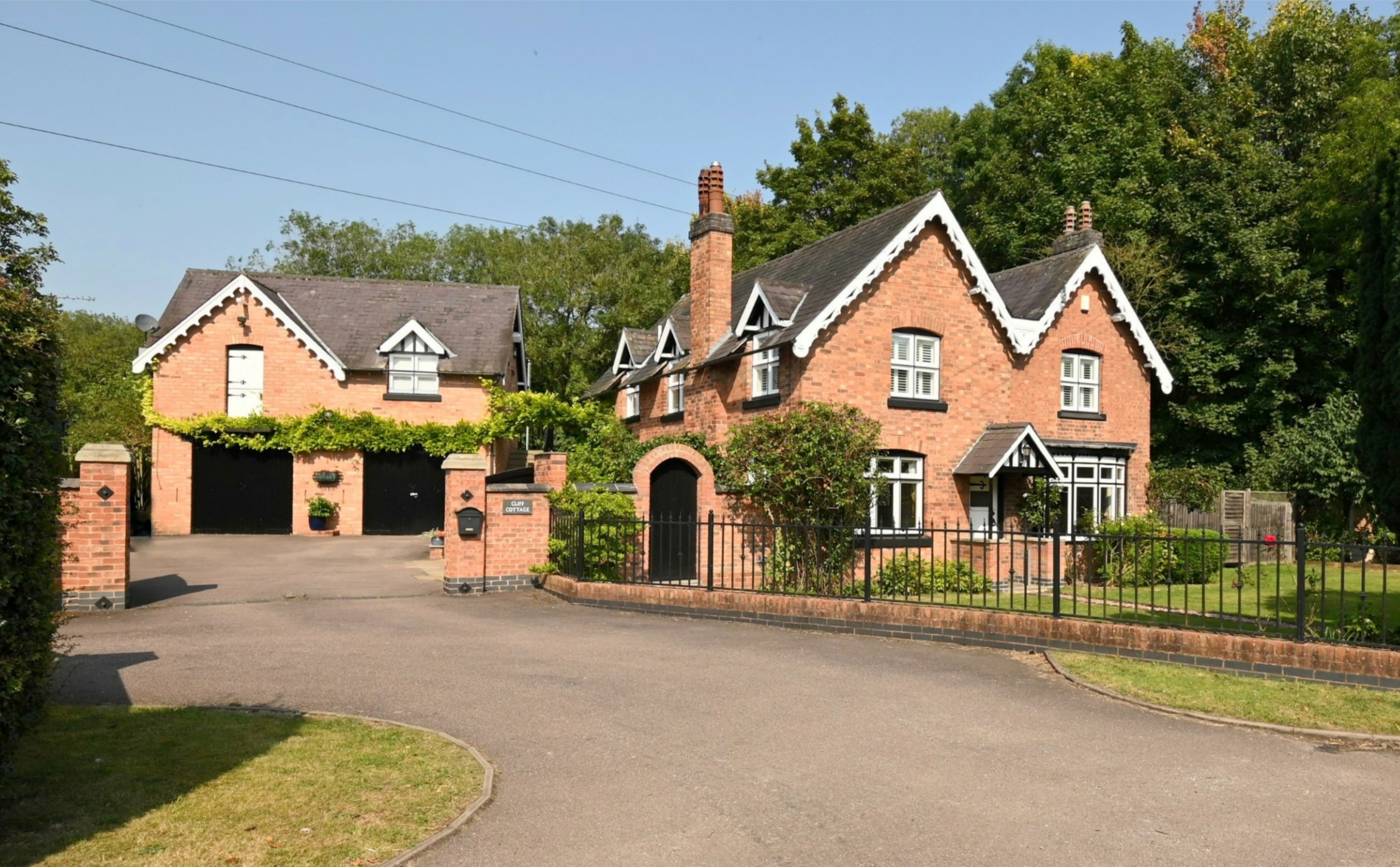
Cliff Cottage, Branston Road, Tatenhill, DE13 9SA