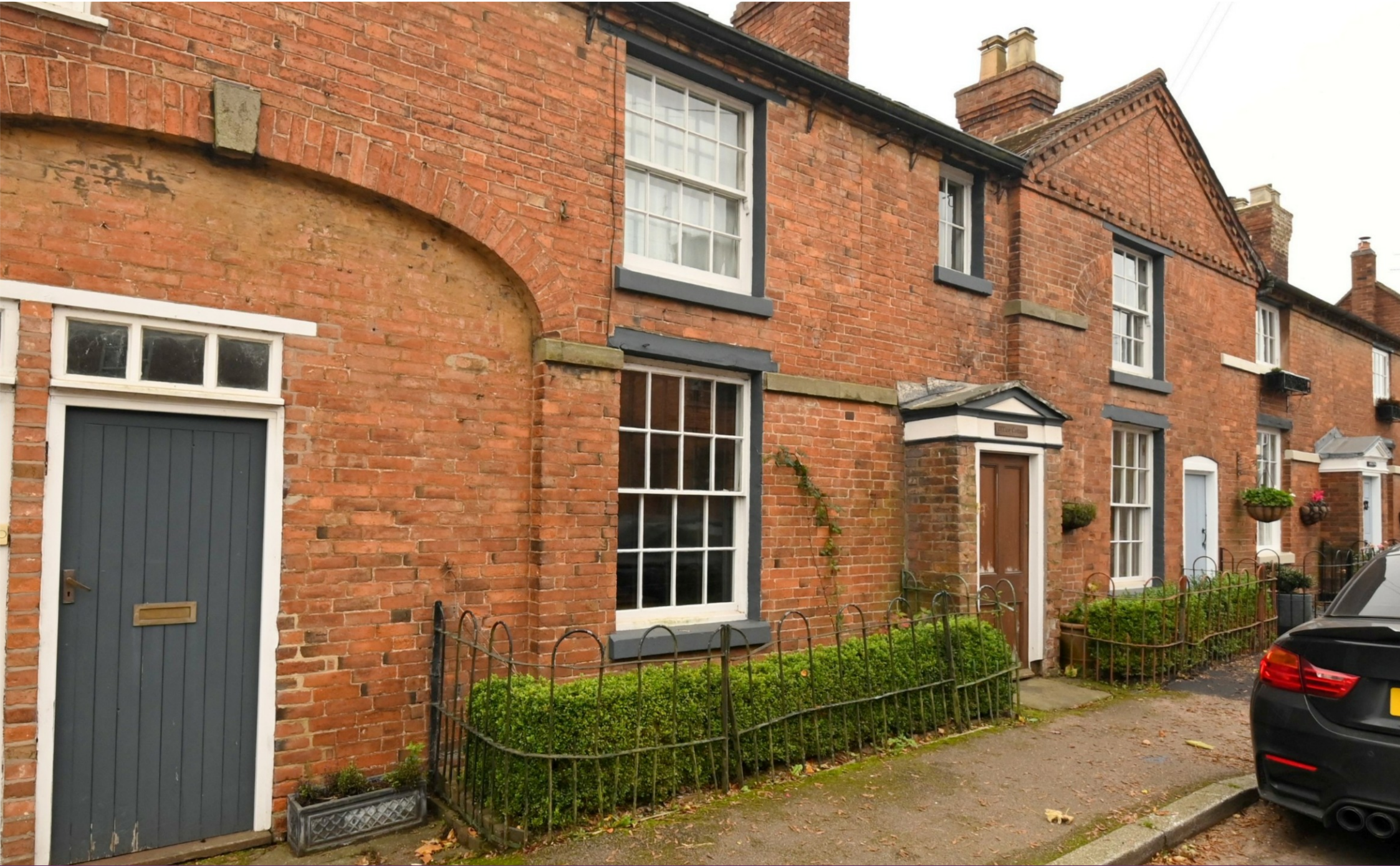
Office Cottage, Uttoxeter Road, Abbots Bromley, WS15 3EG