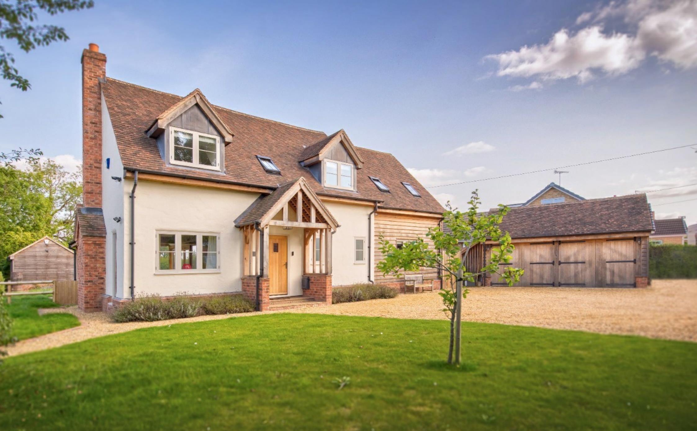
Craythorne Cottage , 51 Beacon Road, Rolleston on Dove, DE13 9EG